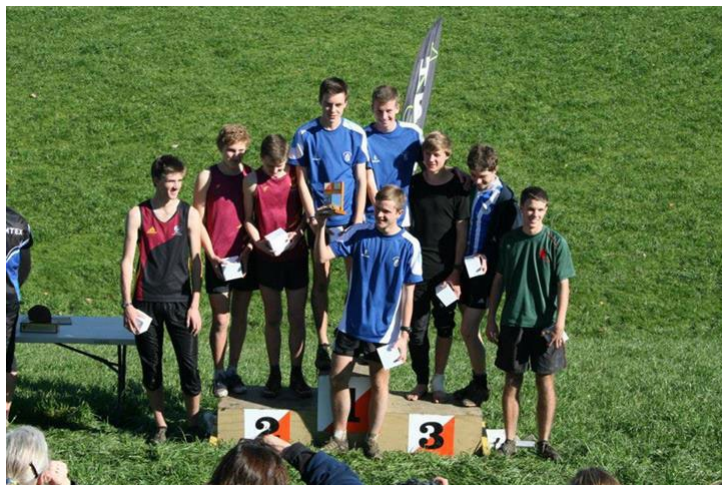
The Cashmere High School relay team, 3rd place in the New Zealand Secondary Schools Orienteering Championships

Wellington Girls' College Wellington Girls' College Cashmere High School Napier Girls High School